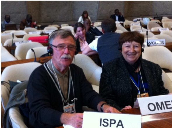
ISPA Delegate at UNESCO

the project, a preparatory meeting was planned on May 13 th 2013.