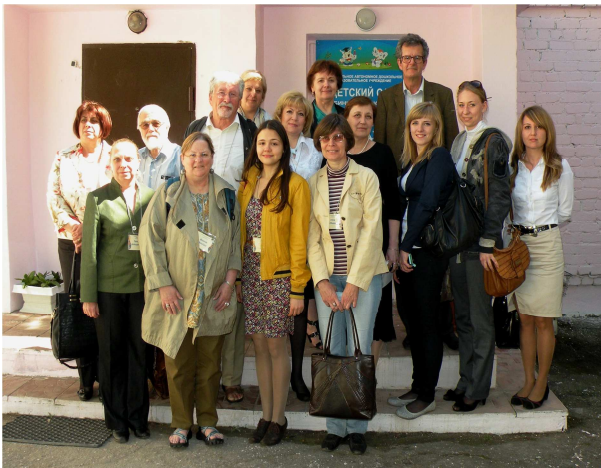
ISPA Samara

The theme of the conference was 'The Child in today's World'. The conference was very well attended, and it was an excellent opportunity for the 4 ISPA delegates to present on topics like Psychological Well-Being, Crisis Management, and Professional Ethics in School Psychology. The conference was organised by the Ministry of Education and Science of the Samara District, the Educational Department of the City Administration, the Moscow City Pedagogical University, and other institutions. As international guests we were invited to visit a kindergarten for blind and low-vision children, a centre where Hippotherapy is used for treating children with emotional challenges, and a government-funded centre that provides continuing professional development for school psychologists.